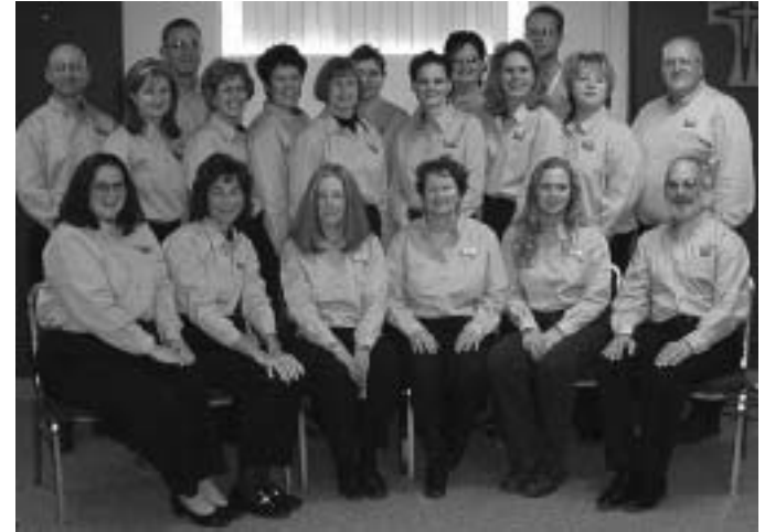
Six Sigma Graduates