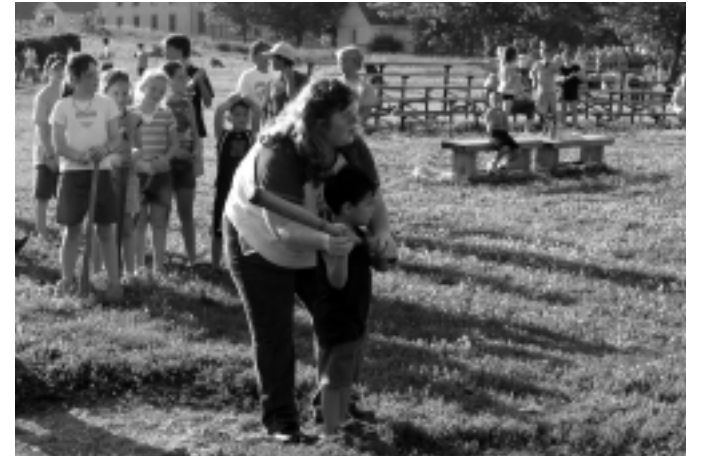
Kids line up to have a chance at bat during a historic baseball game.

A special thank you goes out to all Mercy employees for attending this celebration in honor of Mercy's high Employee Engagement (Gallup) Scores. Thank you also to Mercy Administration for making this celebration possible for employees.