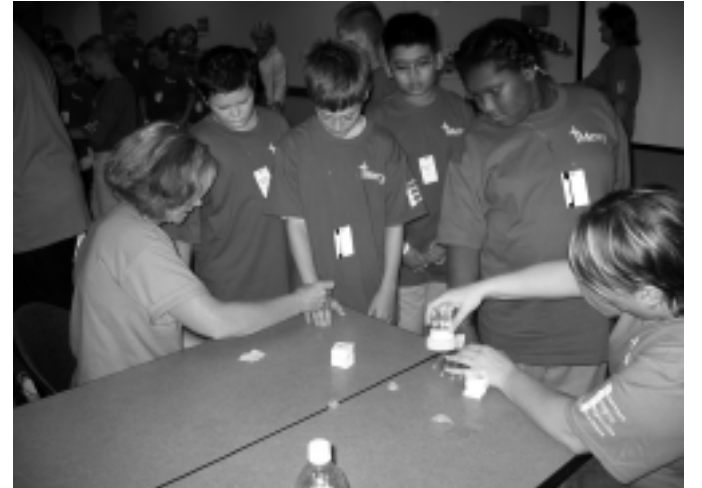
Kids gather around to get a rub-on tattoo before the day's activities begin.