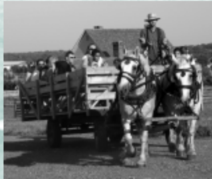
Employees and their families filled the horse and wagon rides throughout the night.