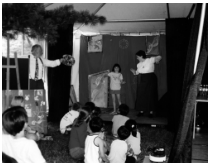
Kids share the stage with Des Moines Playhouse actors at this year's Des Moines Arts Festival.

Mercy Emergency/Trauma Services also provided first aid for the festival.