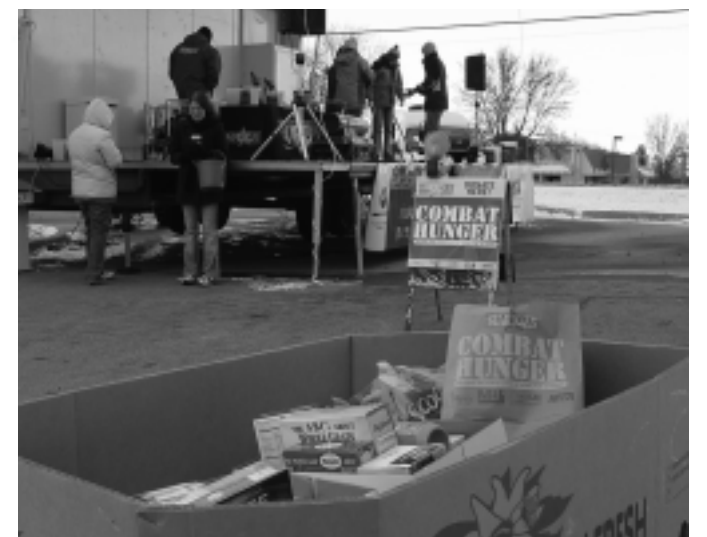
Volunteers from STAR 102.5 and Mercy Medical Center take Combat Hunger donations at the main encampment at Dahl's at 86th and Hickman.

Thank you to all members of the Mercy Family who have given their time and resources to help the less fortunate this year. Your generosity makes a difference in the lives of many people.