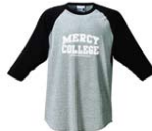
3/4 Sleeve T-Shirt S-3XL