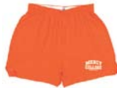
Ladies Shorts XS-XL