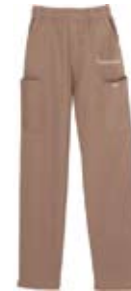
Unisex Cargo Bottoms