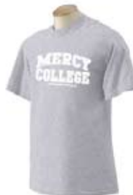
Short Sleeve T-Shirt