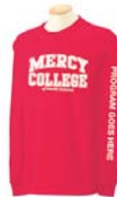
Long Sleeve T-Shirt