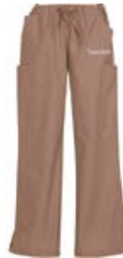
Ladies' Low Rise Flare Bottoms Petite XS-3XL No Tall Sizes