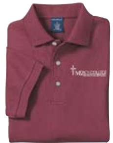
EMS Sport Polo PTA Polo Surgical Tech